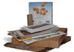
Mixed Paper, Newspaper, Magazines, Boxes empty and flatten