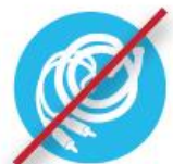
No Tanglers (no hoses, wires, chains or electronics)