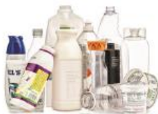
Bottles, Jars, Jugs and Tubs empty and replace cap