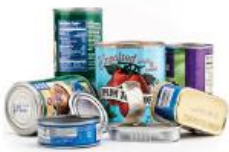
Food and Beverage Cans empty and rinse