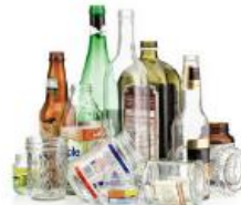
Bottles and Jars empty and rinse