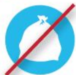
Do Not Bag Recyclables No Garbage