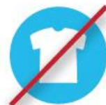
No Clothing or Linens (use donation programs)