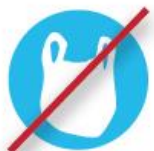
No Plastic Bags or Plastic Wrap (return to retail)